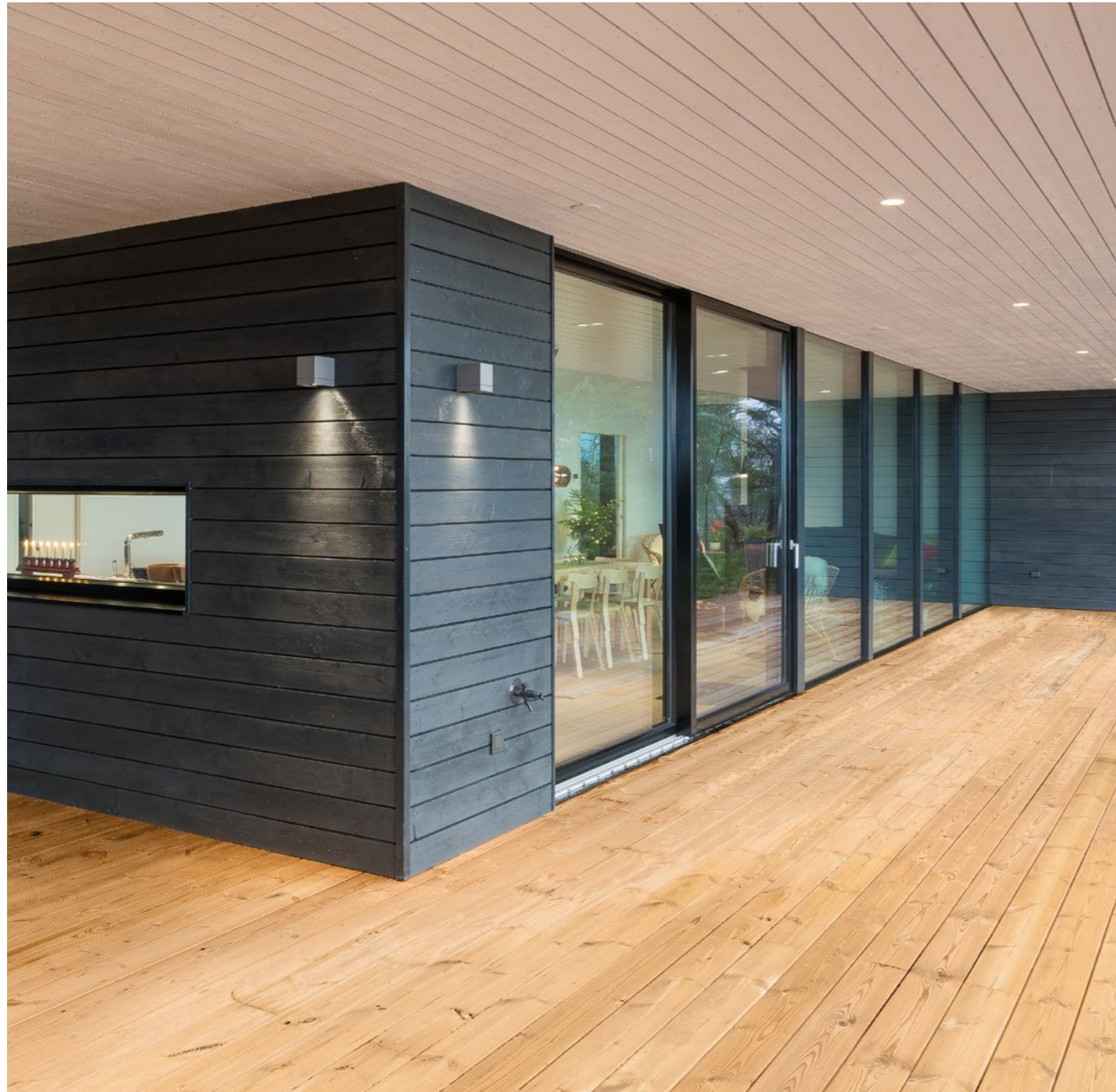
PRIVATE RESIDENCE | SIGGE ARCHITECTS, ANTTI KORPI | LIGHTING DESIGN TECLUX OY + SIGGE / ANTTI KORPI UUSIKAUPUNKI | FINLAND